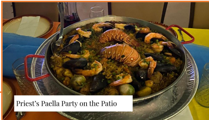
Priest's Paella Party on the Patio